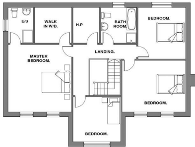
PROPOSED FIRST FLOOR LAYOUT 1/100.