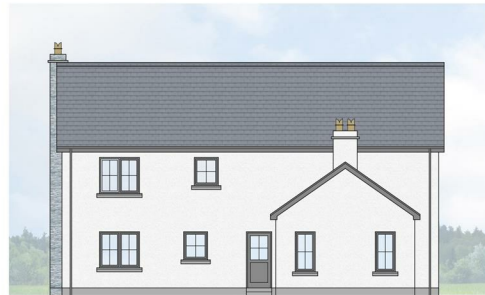
PROPOSED REAR ELEVATION 1-100.