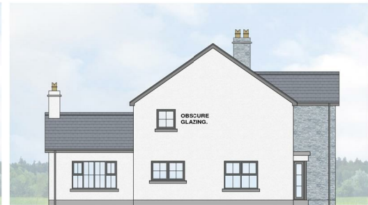
PROPOSED SIDE ELEVATION 1-100.

EXTERNAL FINISHES. ROOF: PLAIN BLACK P.C.C. ROOF TILES WITH P.C.C RIDGE TILES RAINWATER GOODS: 100 DIA HALF ROUND P.V.C. GUTTERS WITH 63 DIA. CIRCULAR DOWNPIPES. (BLACK) FASCIA / SOFFIT: CREAM PVC BY WILPLAS OR EQUAL. WALLS: *K REND PLASTER FINISH CREAM/WHITE WITH SLATE GREY ARCHITECTURAL STONE CLADDING WHERE SHOWN. CILLS: 140 DEEPP.C.C. SILLS WITH MIN LEADING EDGE OF 100. WINDOWS + DOORS: CREAM PVC