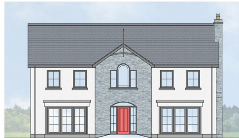
PROPOSED FRONT ELEVATION 1-100.