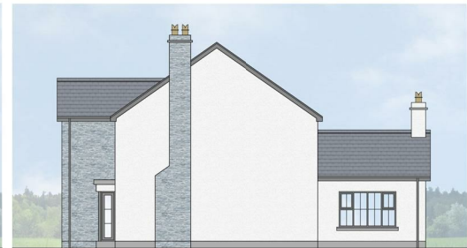
PROPOSED SIDE ELEVATION 1-100.